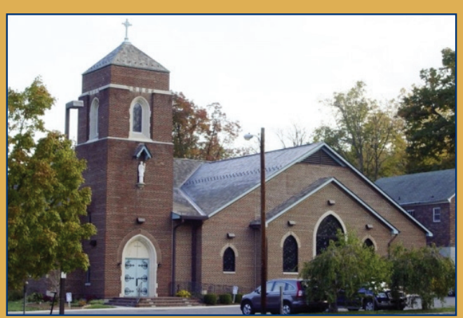
St. Vincent de Paul Parish, Berkeley Springs St. Vincent de Paul Parish in Berkeley Springs used their proceeds from the CSA to meet their monthly mortgage obligation.

Thanks to funds they recieved through the CSA, St. Francis de Sales Parish in Morgantown was able to celebrate a "mortgage burning" with the New Fire of their Easter Vigil.